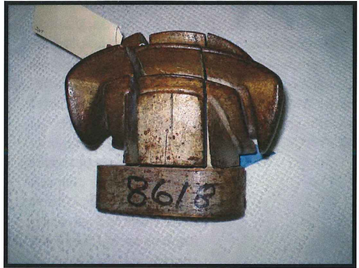
Women's wooden hat mold