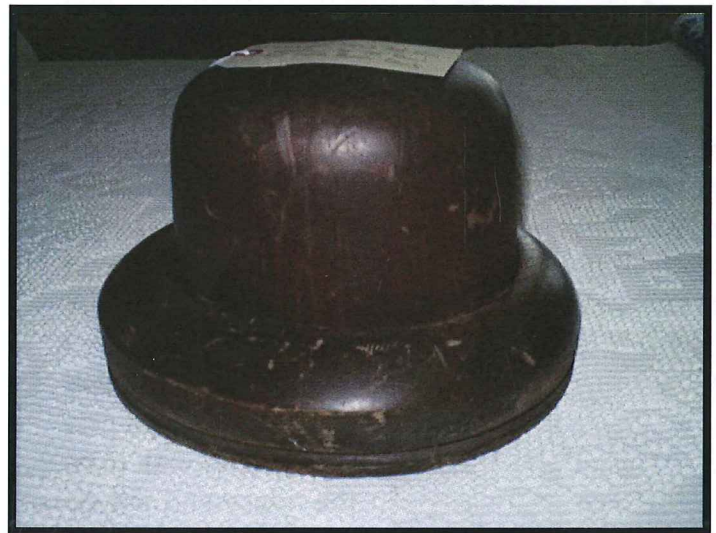
Men's wooden hat mold